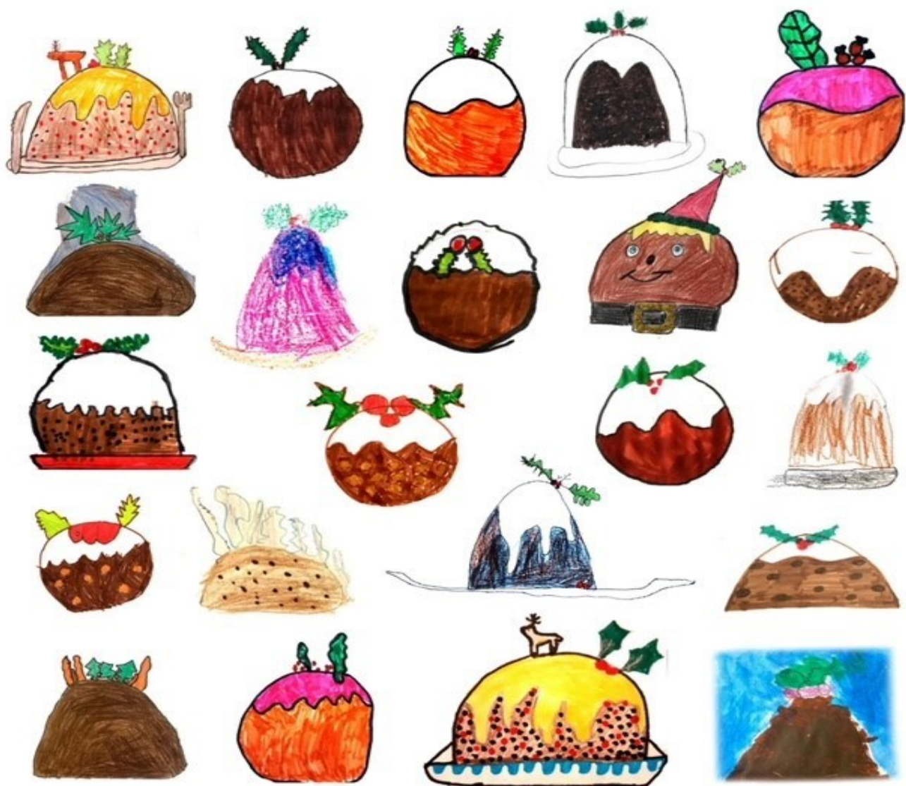
Christmas pudding card