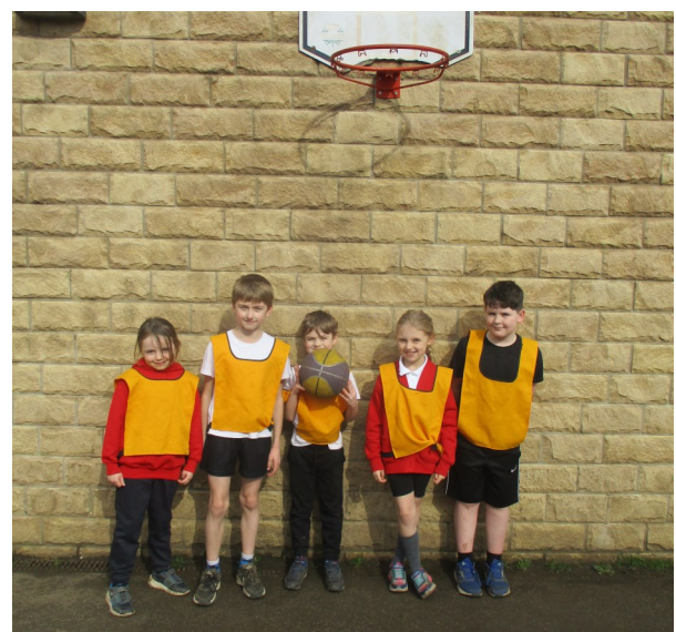
Winners—Team Sciver Brunt