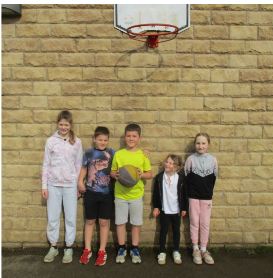
2nd place - Team Sako